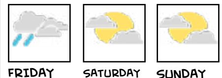
WEATHER COURTESY OF WEATHER.COM